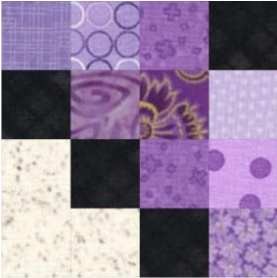
Oct Make 4 - 8 ½" Square

Size: 52 x 56 without borders and up to 66 x 70 with borders