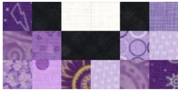
Oct Make 2- 12 ½ x 6